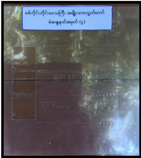
Braille Template for Sagaing state