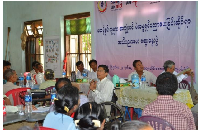
Advocacy and VE training for EMB(Magway)