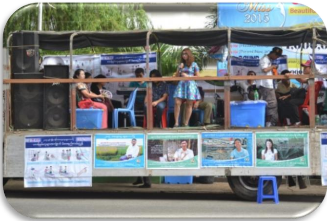
Mobile Theater Awareness Campaign at Ygn