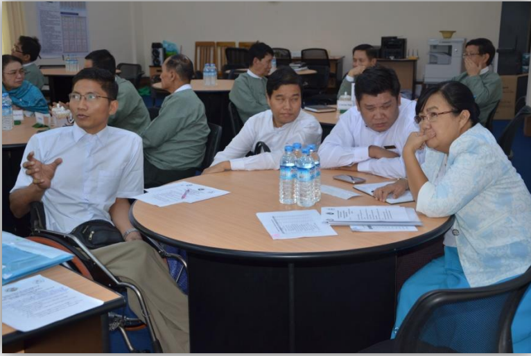
Coordination Meeting with UEC