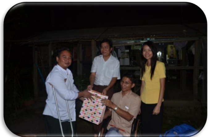
Visit to U Mhone Aung , MP of Oakpho township