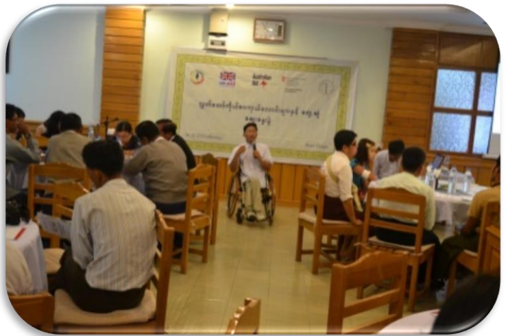
Forum with candidates with Mdy