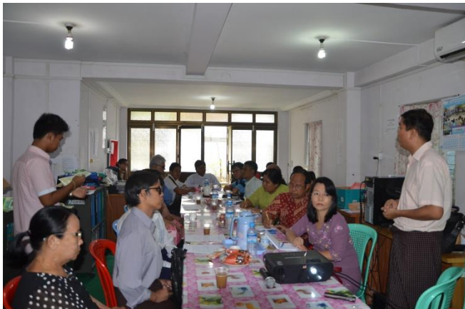
Coordination Meeting with DPOs