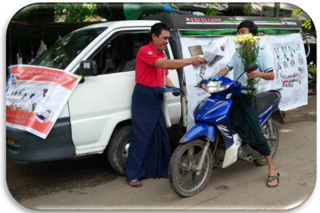
Palm-flat campaign at Yekyi