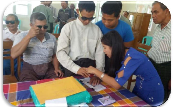
Training on how to vote with braille template