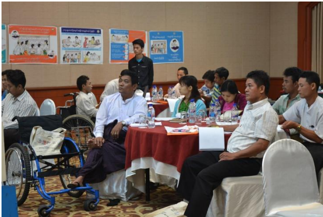
3-day TOT training