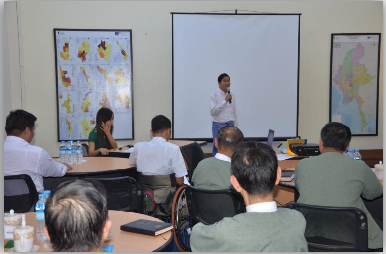
Coordination Meeting with UEC