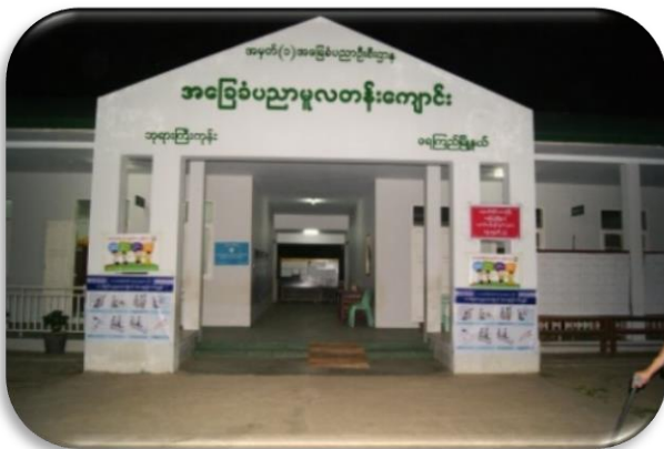
Model Polling Station at Yekyi