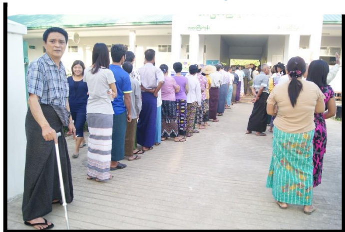
Disabled volunteer in polling station(Yekyi)