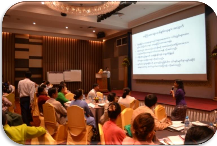
Forum with candidates at Ygn