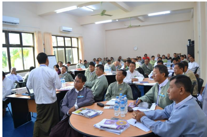
Poll Worker Training