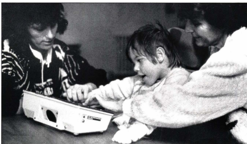
Plans can be developed to enable teaching to be carried out at home.