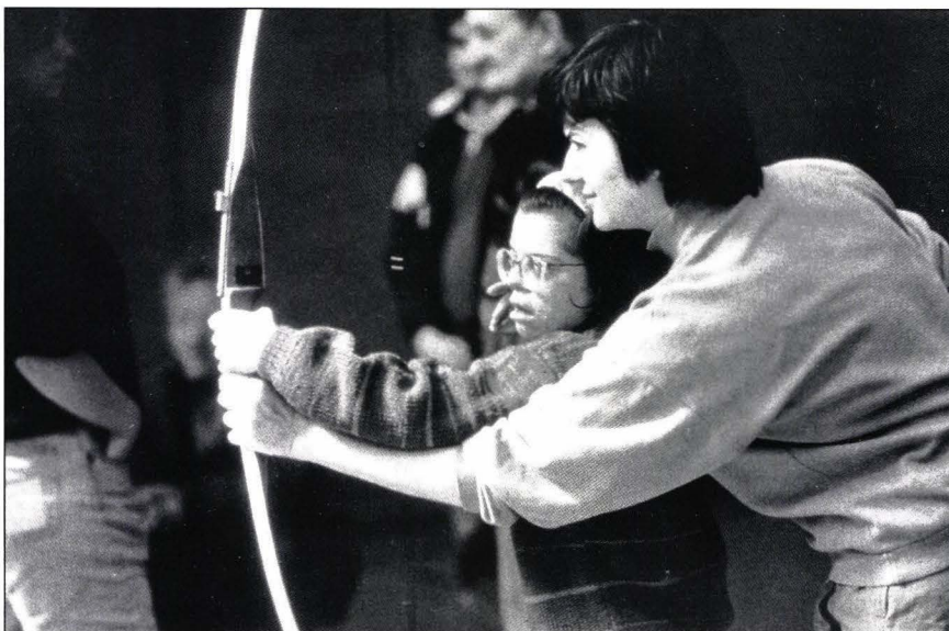
People with intellectual disabilities are able to learn, provided they are properly taught and given sufficient time.