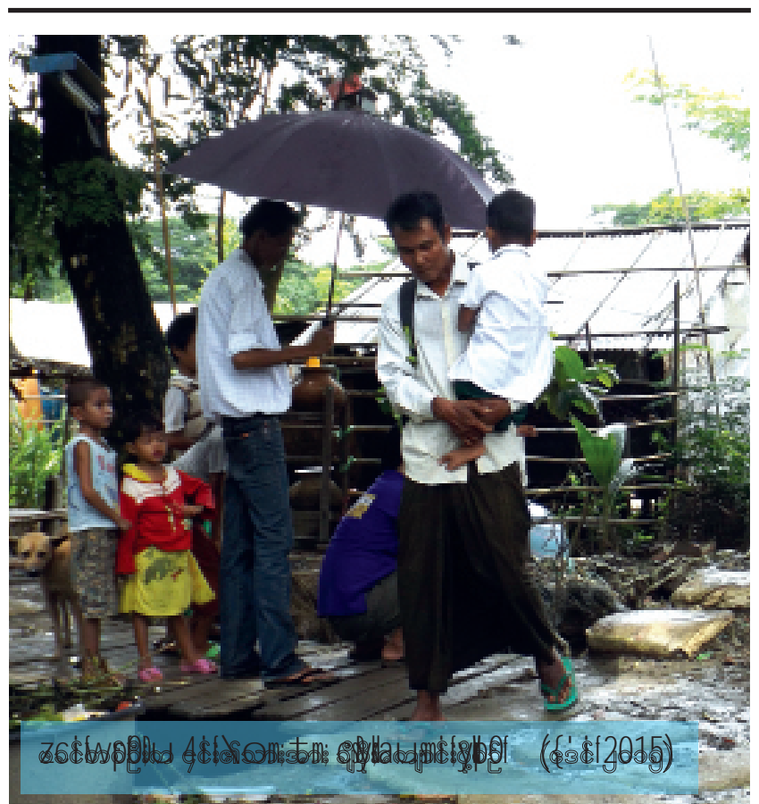
အဖွဲ့အစည်းများ၏ အခွင့်အရေးများနှင့်ဆက်သွယ်မှု (၂၀၁၅)

တစ်ဖက်တွင် အဖွဲ့အစည်းများ၏ အခွင့်အရေးများကို ထိခိုက်စေရန်အတွက် အစိုးရနှင့် အဖွဲ့အစည်းများအကြား ဖြစ်ပေါ်စေရန်အတွက် (တစ်ဖက်တွင် အစိုးရနှင့် အဖွဲ့အစည်းများအကြား) (ရုပ်ပုံ ၈)