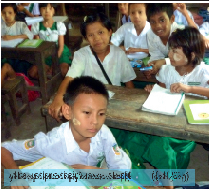
၅.၄ ယူစာပေဗဟိုဌာနမှ ဖော်ပြချက် (၂၀၁၅)

a&;w0 frby0i fvmE0 fa&;q0 &m v0t ycsufrsm; u0a xmu0y0ay; jci f w0 u0b0t axmu0t u0jy0k aqmi &0 u0ay; r0rsm; w0w0u0fz0p0x0e0f vma&;w0 f r@0i fzpaom r0brsm; \ p0w0a0e0p0w0x0m; q0 &m oabm0b0m0u0 w0e0q0m0q0i0ay; aey0gn0f