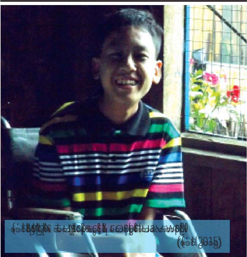
ခွင့်အလမ်းများကို အကဲဖြတ်ခြင်း အခွင့်အလမ်းများ (၂၀၁၅)