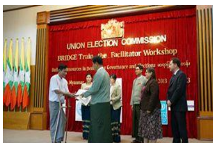
Bridge Training for Facilitators: Building Resources in Democracy, Governance and Elections