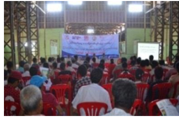
Voter Education Training at Kawmhue