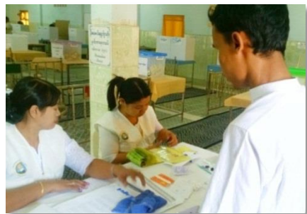
Casting by visually impaired person at Kyeemyindine Polling Station (2015)