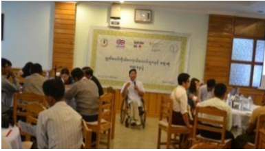
Workshop with candidates for rights of PwDs (Mandalay)