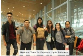
Myanmar Team for Exposure trip to Indonesia