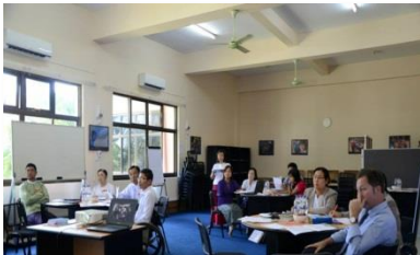
Presentation to UEC for feedback and suggestion from consultation meeting with DPO & Special Schools