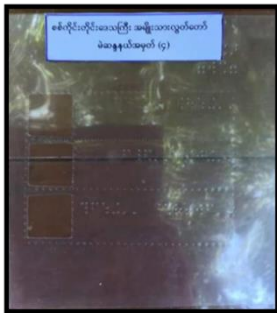
Braille Template for Amyother Hluttaw Constituency (4) - Sagaing Region (2015)

Collaboration with UEC for developing Braille template to vote by visually impaired person independently and secretly