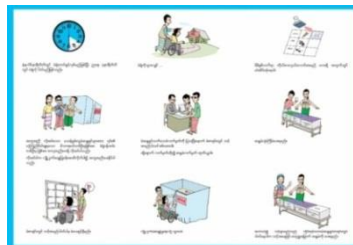
Inclusive Voter Education Materials on how to vote in Election