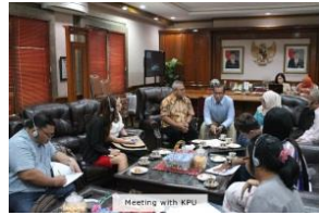
Meeting with KPU