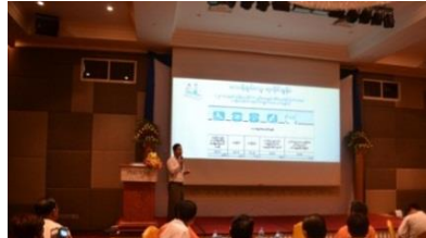
Workshop with candidates for rights of PwDs (Yangon)