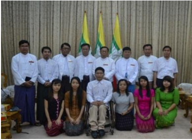
Advocacy Meeting with UEC