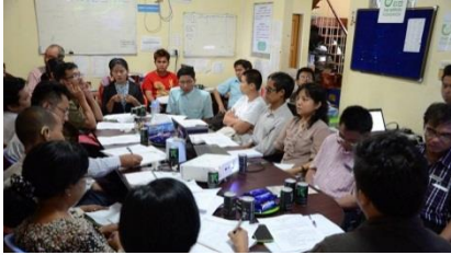
Consultation Meeting with DPOs and Special Schools