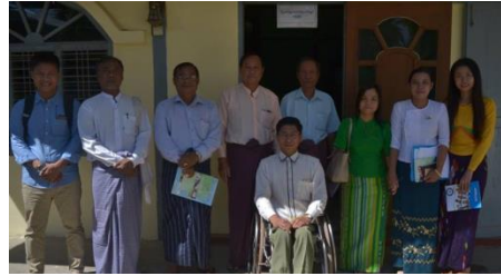
Advocacy Meeting with township Sub-UEC