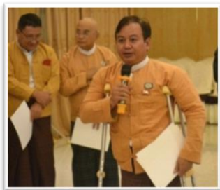
Saw Thura Aung Bago Regional Parliament Oakpho Constituency - 2 Physically Impaired Person