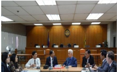
Exposure trip to ASEAN countries to study good practices of Inclusive Elections

Exposure trip to Philippines and Indonesia to study good practices of electoral system together with UEC