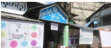
Polling Station at Tarmwae tsp (2018 By-Election)