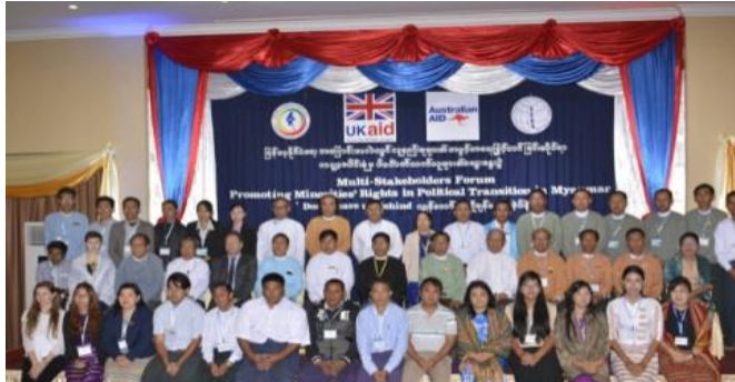
Gp Photo on Multi-Stakeholder Forum: Promoting Minorities' Rights in Political Transition in Myanmar (2018)