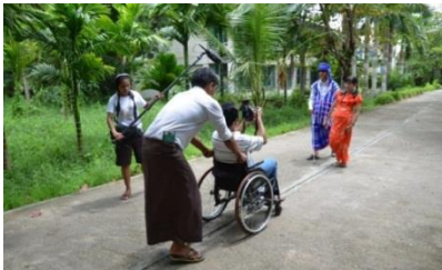
Filming Precious Ballot Short Video