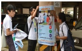
Participation in UEC Pilot project on voter education and voter list at Ahlone tsp