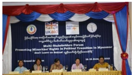
Panel Discussion on Minorities rights