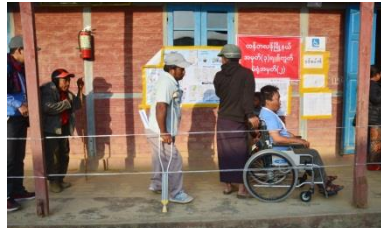
Model Polling Station at Htantalang Township (2017)