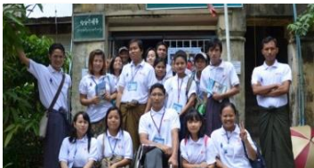
Participation in UEC Pilot project on voter education and voter list at Ahlone tsp