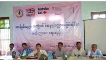
Voter Education Training at Magway tsp