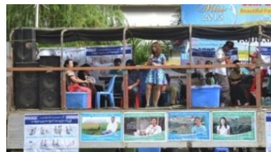
Voter Education Campaign with mobile car