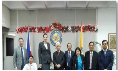
Exposure trip to ASEAN countries to study good practices of Inclusive Elections