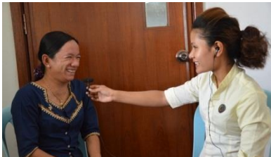
Radio Program on Electoral and Political Rights of PwDs