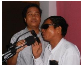
Radio Program on Electoral and Political Rights of PwDs