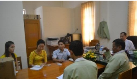
Advocacy Visit to Sagaing Regional Parliament