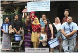
Meeting with KPU