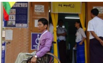
Observation by PwDs in 2017 By-Election