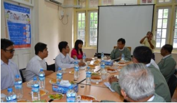
Advocacy meeting with Union Election Commission