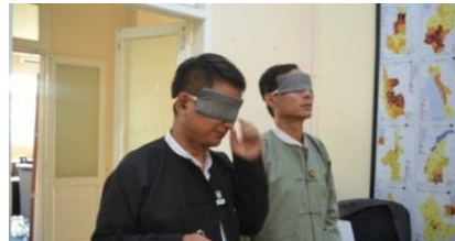
Disability Inclusion Training for UEC