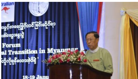
Opening Remark by Chairperson of UEC