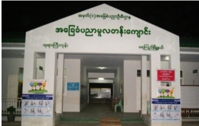
Model Polling Station at Yekyi tsp (2015)

Meeting with Sub-UEC to implement Model Polling Stations