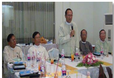
Advocacy Meeting with Union Parliament