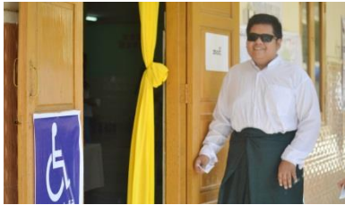
Model Polling Station at Kyee Myin Dine Township (2017)