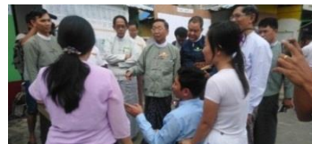
Observation at Tarmwae tsp Before Election Day (2018 By-Election)