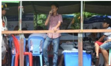
Voter Education Campaign with mobile car