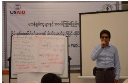
Peace Building Training for PwDs and Marginalized People (2018)