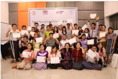
Political Science Training for PwDs and Marginalized People (2018)