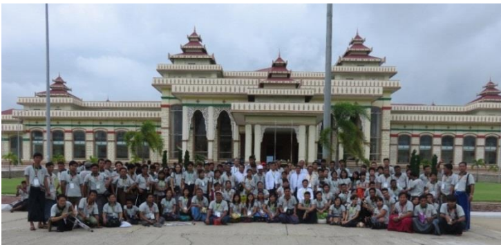
Exposure and Excursion Visit to Union Parliament (2016)