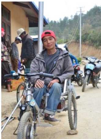
Providing Assistive Device to PwDs (Htantalan, Chin State)