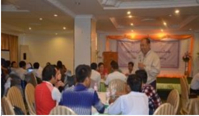
3 Days Civic Education Training for PwDs