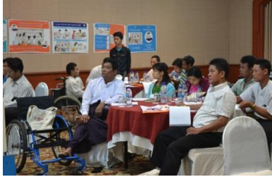
TOT for Inclusive Political and Electoral Training for PwDs (2015)