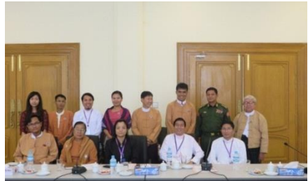
Advocacy Visit to Union Parliament