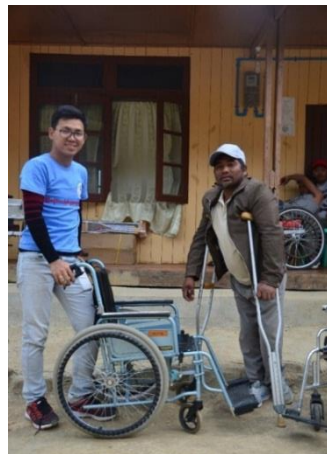
Providing Assistive Device to PwDs (Htantalan, Chin State)