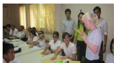
Voter Education Training with Braille Template