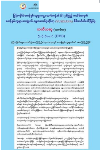
Winner's news (2 nd runner up)