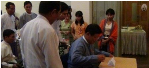
Disability Inclusion Training for UEC