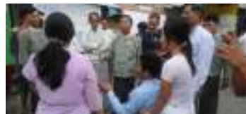
Observation at Tarmwae tsp Before Election Day (2018 By-Election)