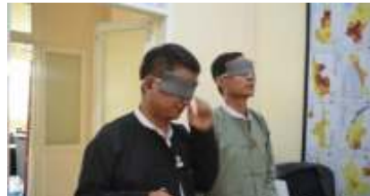
Disability Inclusion Training for UEC