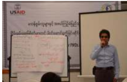
Peace Building Training for PwDs and Marginalized People (2018)