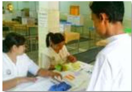
Casting by visually impaired person at Kyeemyindine Polling Station (2015)