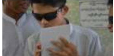
Using Braille Template by visually impaired person

It is amazing to see that voters with visual impairments are voting independently in 2017 by-election (Monywa). I found UEC prepared the accessible election so that voters with visual impairment can use Braille ballot template and vote independently in secret. It is not happening yet even in some countries. I am very satisfied to see the progress here”