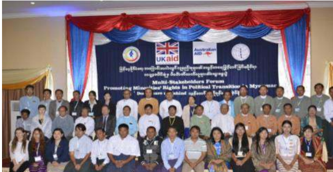
Gp Photo on Multi-Stakeholder Forum: Promoting Minorities' Rights in Political Transition in Myanmar (2018)