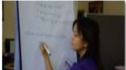
Presentation to UEC for feedback and suggestion from consultation meeting with DPO & Special Schools