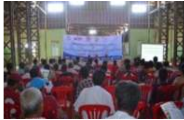
Voter Education Training at Kawmhue