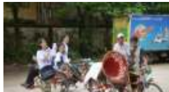
Participation in UEC Pilot project on voter education and voter list at Ahlone tsp