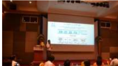
Workshop with candidates for rights of PwDs (Yangon)