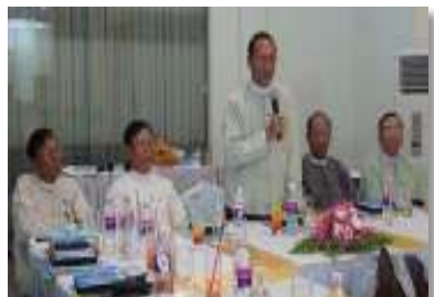
Advocacy Meeting with Union Parliament