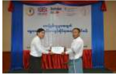
TOT for Inclusive Political and Electoral Training for PwDs (2015)