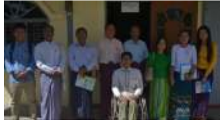
Advocacy Meeting with township Sub-UEC