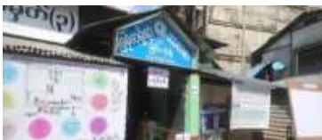
Polling Station at Tarmwae tsp (2018 By-Election)