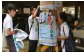
Participation in UEC Pilot project on voter education and voter list at Ahlone tsp