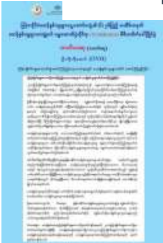
Winner's news (2 nd runner up)

Political and Electoral Training for PwDs (2017-2018)