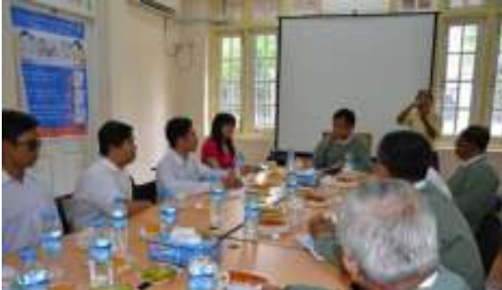
Advocacy meeting with Union Election Commission