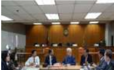
Exposure trip to ASEAN countries to study good practices of Inclusive Elections

Exposure trip to Philippines and Indonesia to study good practices of electoral system together with UEC