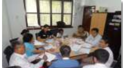
Consultation Meeting with DPOs and Special Schools