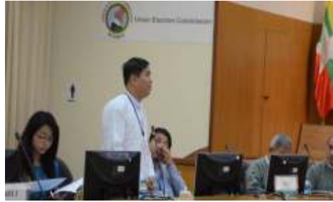
Advocacy Meeting with UEC