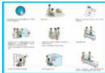
Inclusive Voter Education Materials on how to vote in Election