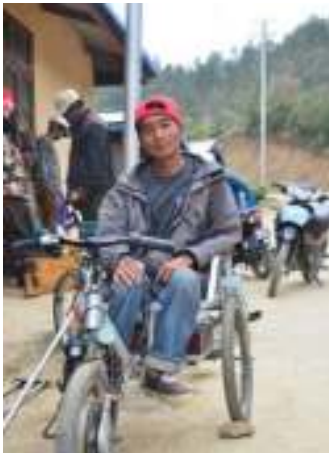
Providing Assistive Device to PwDs (Htantalan, Chin State)