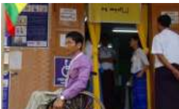
Observation by PwDs in 2017 By-Election