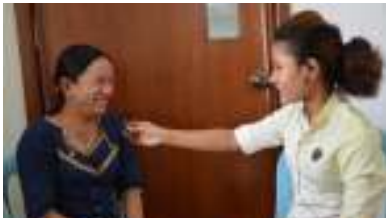
Radio Program on Electoral and Political Rights of PwDs