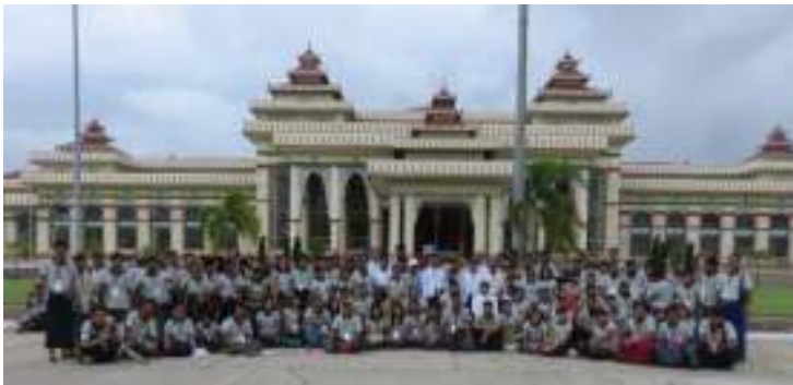
Exposure and Excursion Visit to Union Parliament (2016)