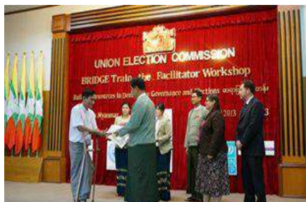
Bridge Training for Facilitators: Building Resources in Democracy, Governance and Elections