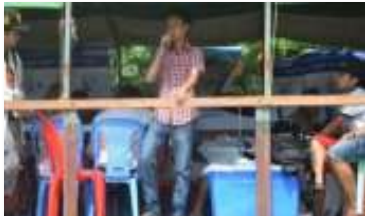
Voter Education Campaign with mobile car