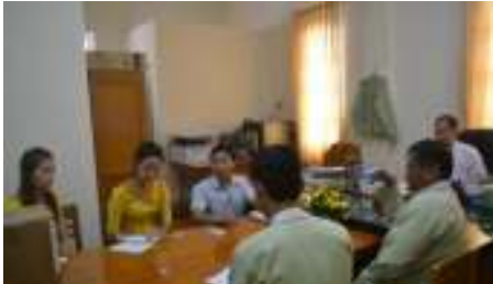
Advocacy Visit to Sagaing Regional Parliament