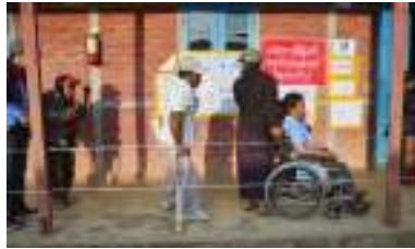
Model Polling Station at Htantalang Township (2017)