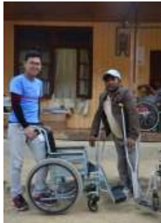
Providing Assistive Device to PwDs (Htantalan, Chin State)