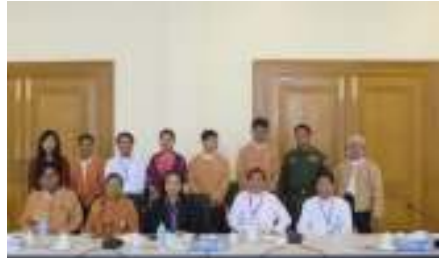
Advocacy Visit to Union Parliament