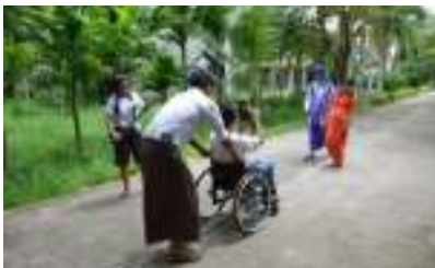
Filming Precious Ballot Short Video