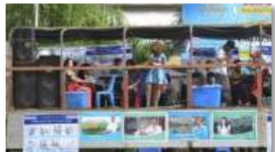
Voter Education Campaign with mobile car