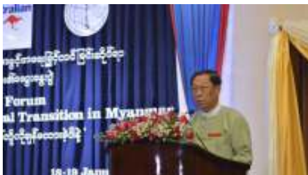
Opening Remark by Chairperson of UEC