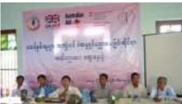
Voter Education Training at Magway tsp