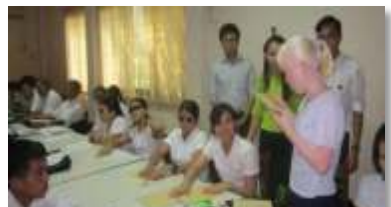
Voter Education Training with Braille Template