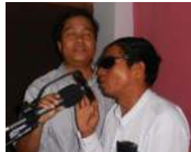
Radio Program on Electoral and Political Rights of PwDs