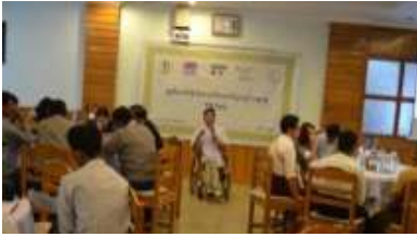
Workshop with candidates for rights of PwDs (Mandalay)