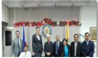
Exposure trip to ASEAN countries to study good practices of Inclusive Elections