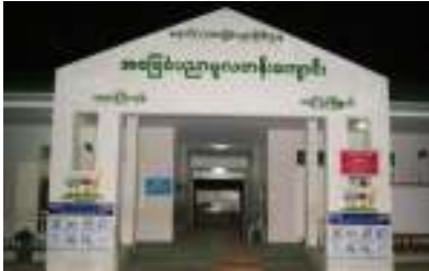
Model Polling Station at Yekyi tsp (2015)

Meeting with Sub-UEC to implement Model Polling Stations