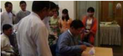
Disability Inclusion Training for UEC