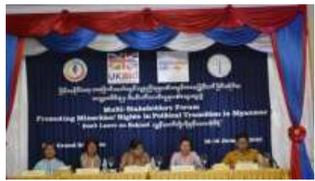
Panel Discussion on Minorities rights