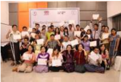
Political Science Training for PwDs and Marginalized People (2018)