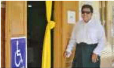
Model Polling Station at Kyee Myin Dine Township (2017)