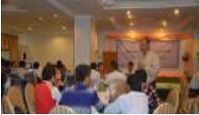
3 Days Civic Education Training for PwDs