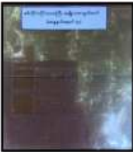
Braille Template for Amyother Hluttaw Constituency (4) - Sagaing Region (2015)

Collaboration with UEC for developing Braille template to vote by visually impaired person independently and secretly